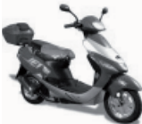
LIFAN JET 50

WE CAN KIT YOU OUT WITH ALL THE GEAR FROM GLOVES TO BIKES AND THEN WE CAN TRAIN YOU