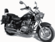
PIONEER NEVADA 125

LARGE RANGE OF BIKE CLOTHING, HELMETS & ACCESSORIES